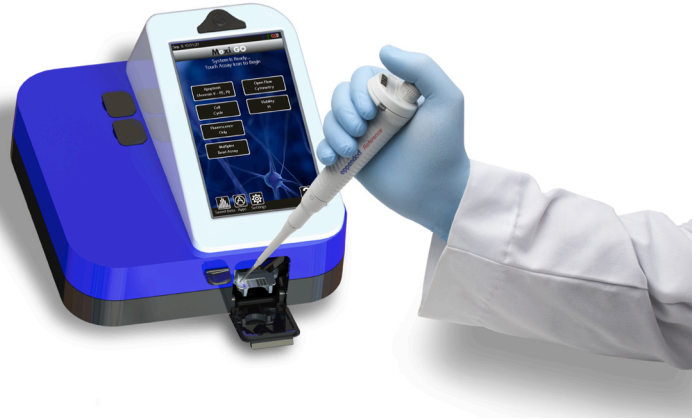
Figure 1 – Orflo's Moxi GO II – Next Generation Flow Cytometer. Image shows user loading a sample into the two-test disposable flow cell. The Moxi GO II is a configurable flow cytometer with a 488nm laser and up to two fluorescence recording channels (2 PMT's with emission filters at 525/45nm filter and 561nm/LP, respectively).

Numerous transfection/transduction approaches have been developed for introducing the cloning vectors into the cells, ranging from viral (i.e. viral transduction) to chemical (e.g. lipofection), and physical (e.g. electroporation). 1 These techniques are coupled with the use of DNA restriction endonucleases or, alternatively, the Clustered Regularly Interspaced Short Palindromic Repeats (CRISPR)/Cas-9 subsystem (an RNA restriction enzyme approach) to ensure the proper insertion of the sequence into the host genome. The CRISPR approach, in particular, has received tremendous momentum over the past couple of years due to its low cost, versatility and simplicity. 2