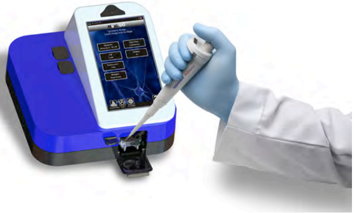
Figure 1 – Orflo's Moxi GO II – Next Generation Flow Cytometer. Image shows user loading a sample into the two-test disposable flow cell. The Moxi GO II is a configurable flow cytometer with a 488nm laser and up to two fluorescence recording channels (2 PMT's with emission filters at 525/45nm filter and 561nm/LP, respectively).

Cellular apoptosis is a sophisticated mechanism employed by cells to carefully control death in response to cell injury. Commonly referred to as “programmed cell death,” apoptosis progresses through a systematic signaling cascade that results in characteristic, directed morphological and biochemical outputs in the cell. The overall outcome is a highly regulated cell death process that minimizes trauma to the cell's extracellular environment. At a systemic level, the critical role of apoptosis is easily highlighted through its implication in hearing loss 1 , cardiovascular failure 2 , cancer progression 3 , neurodegenerative disorders 4 , and numerous other pathologies 5 . Correspondingly, scientific research has intently focused on revealing the underlying pathways of apoptosis, defining its external triggers, identifying therapeutic interventions, and further exploring the role of apoptosis in numerous pathologies. Furthermore, the monitoring of apoptosis has also been established as a key indicator in identifying the “biocompatibility” of pharmaceuticals and other environmental conditions for cell systems.